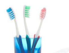
Superior hygiene products