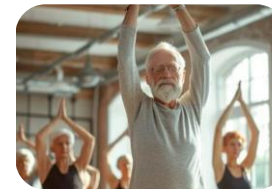
Meditation private classes