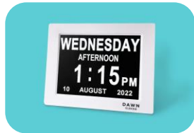
Easy-read digital clock and calendar