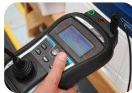
Test and tagging of personal electrical items