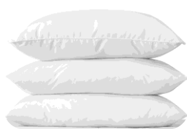
Pillow menu and new pillows