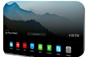
In-room smart TV