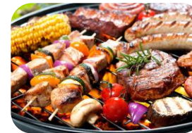
Special "take in" meal / BBQ