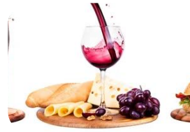
Alcohol / soft drink with meals