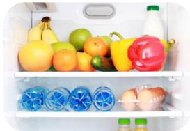
Fully serviced bar fridge / personal mini bar