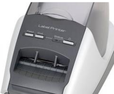
Professionally printed clothing name labels